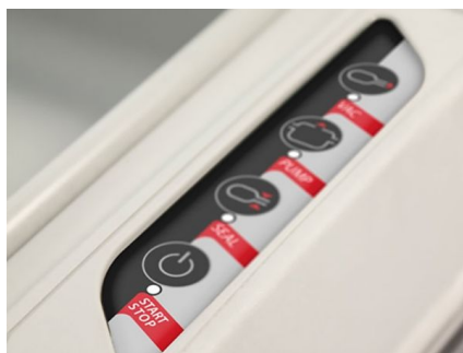
Touch control panel